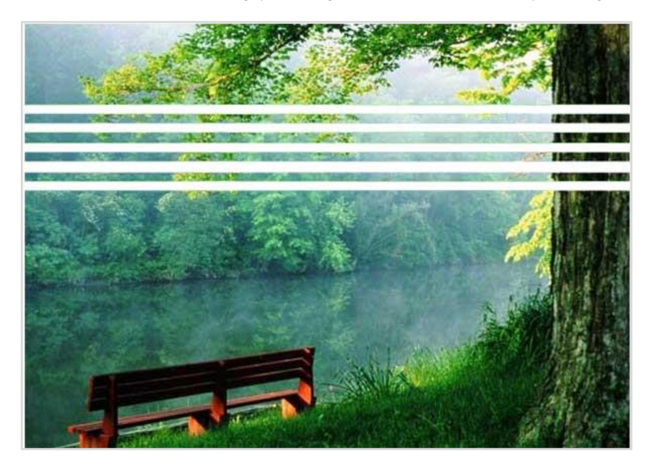
The Fix: Set line-height for each TD to be the same height as the image it contains

Outlook 2013 avoids some of the pitfalls of its predecessors, but it comes with its own unique challenges. For instance, spliced images that render perfectly in Outlook 2007 and 2010 will sometimes show a large (~10px) gap in Outlook 2013. This problem only applies to images that are less than 20px tall. Luckily, with one little trick (below) this problem is easy to solve. After the fix, we'll cover some basics of using spliced images in a table structure, in case you've forgotten.